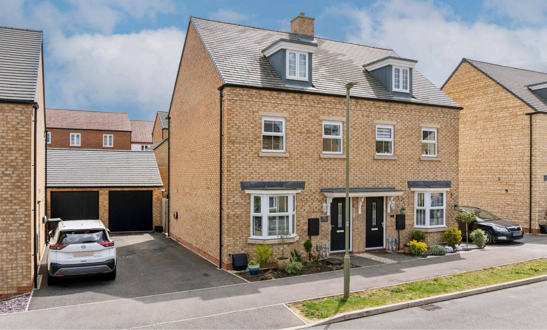
46a Heron Drive, Witney