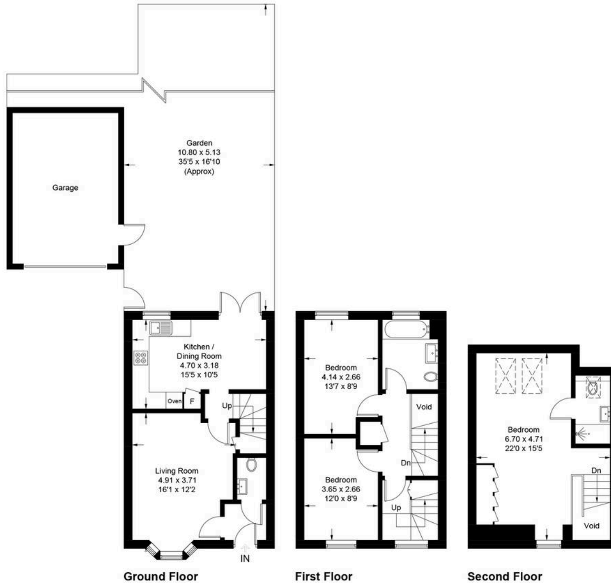
Illustration for identification purposes only, measurements are approximate, not to scale. Fourlabs.co © (ID1302829)