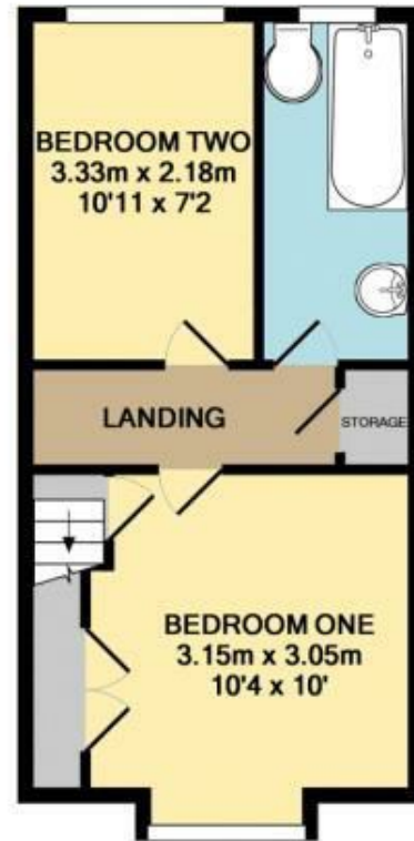
1ST FLOOR APPROX. FLOOR AREA 27.2 SQ.M. (293 SQ.FT.)

TOTAL APPROX. FLOOR AREA 54.3 SQ.M. (585 SQ.FT.)