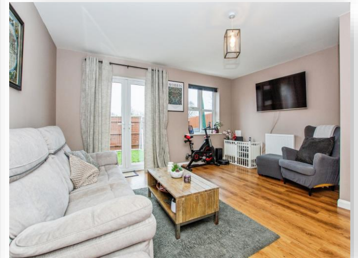
Fenmen Place, Wisbech PE13 3FA