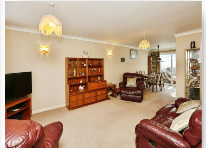
Howard Close, Lee-On-The-Solent, PO13 8LU