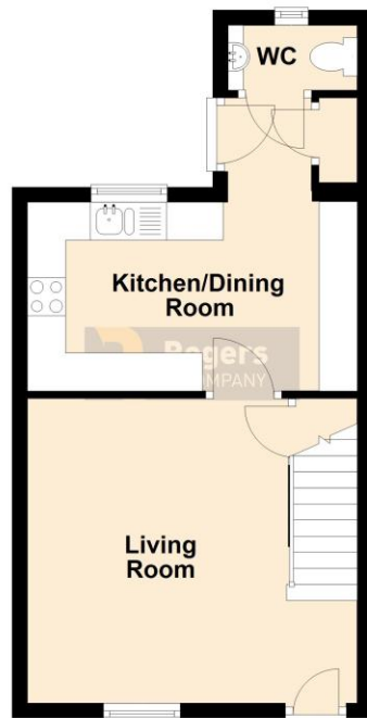
Ground Floor Approx. 32.7 sq. metres (352.5 sq. feet)