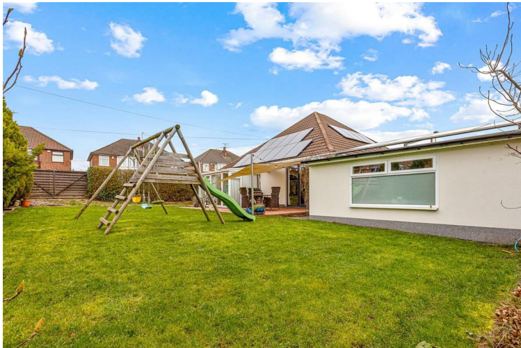
OUTSIDE Paved seating area, wide garden laid to lawn with flower borders and trees, water tap, aluminium gate to front aspect, set of wooden doors to side aspect.

Separate W/C, tiled floor, low level W/C, tiled walls, spot light, basin and extractor.