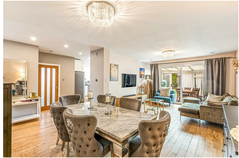
OPEN PLAN LOUNGE / DINING AREA 22'4" x 13'5" (6.81 x 4.11)

Local amenities are handy, with shops, eateries, and regular bus routes nearby, quick access to Fosse Park for broader shopping options. Transport links are excellent: the M1 and M69 motorways are easily reachable for commuters, while Leicester city centre close by.