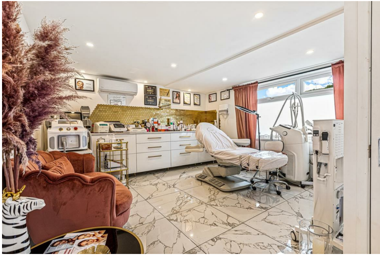
HOME OFFICE 16'8" x 12'9" (5.10 x 3.91) Currently used as a beauty salon

Built in storage cupboard, tiled floor, electric under floor heating, spot lights, double glazed window to rear elevation and double glazed door to side aspect.