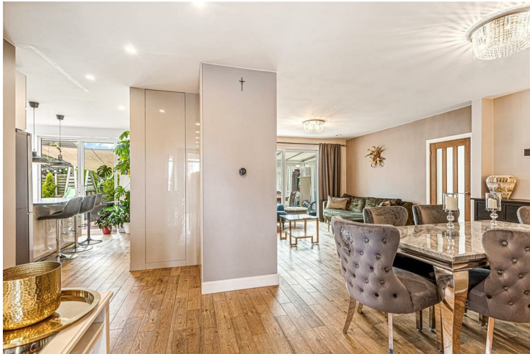
ENTRANCE HALL AREA

Double glazed sliding doors to rear leading into conservatory, door leading into bedroom one, underfloor heating.