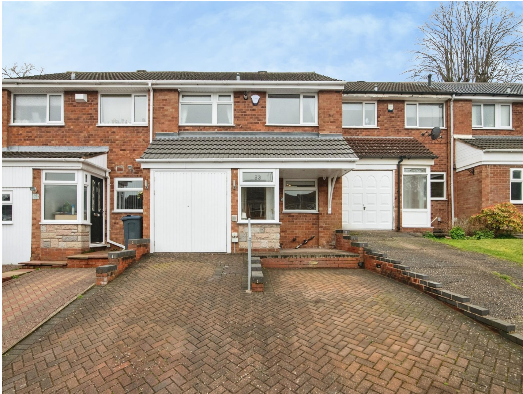
Croyde Avenue, Birmingham B42 1JB