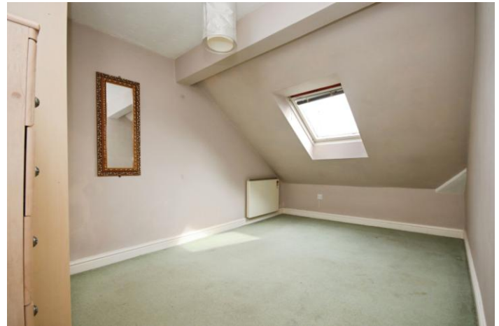
Ground Floor Approx. 7.2 sq. metres (77.9 sq. feet)

Regulated by RICS. Mundys is the trading name of Mundys Property Services LLP registered in England NO. OC 353705. The Partners are not Partners for the purposes of the Partnership Act 1890. Registered Office 295 Silver Street, Lincoln, LN2 1AS.