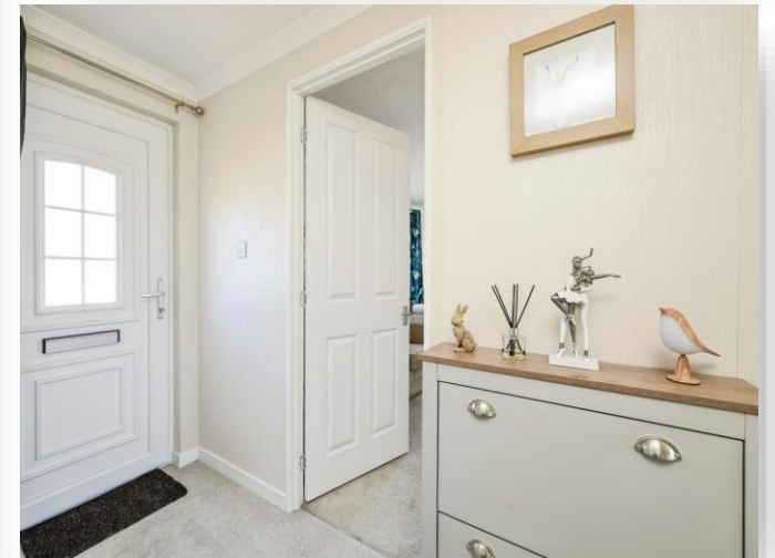
Mandalay Park, Whittlesey Peterborough PE7 1WF