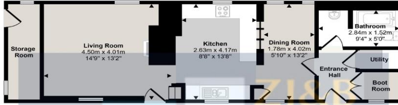
Ground Floor Approx 55 sq m / 587 sq ft

Approx Gross Internal Area 101 sq m / 1088 sq ft