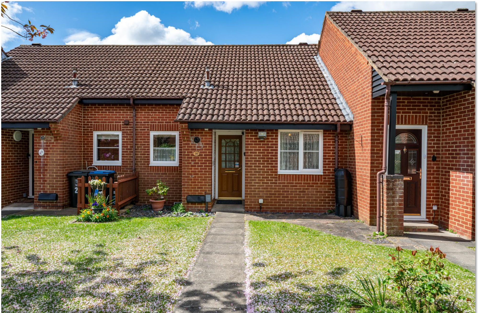
Emerton Garth, Northchurch Berkhamsted HP4 3XJ