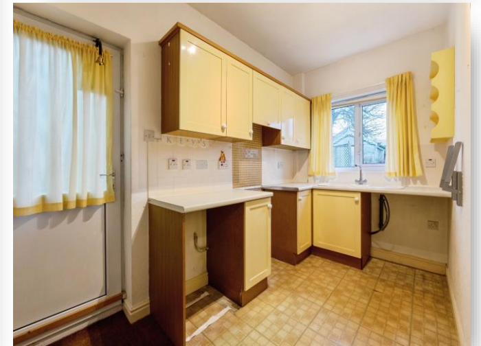
Chater Close, Leicester LE5 2HX