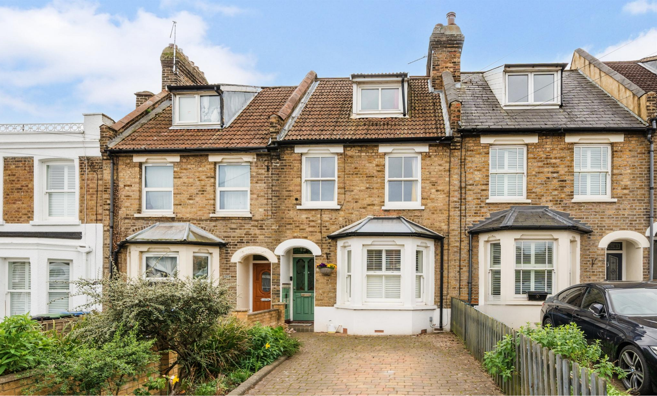
Gordon Hill, Enfield, EN2 0QT

Not for marketing purposes INTERNAL USE ONLY