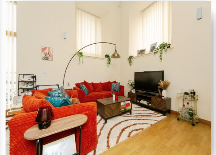
East Float Quay, Dock Road, Birkenhead, CH41 1DP