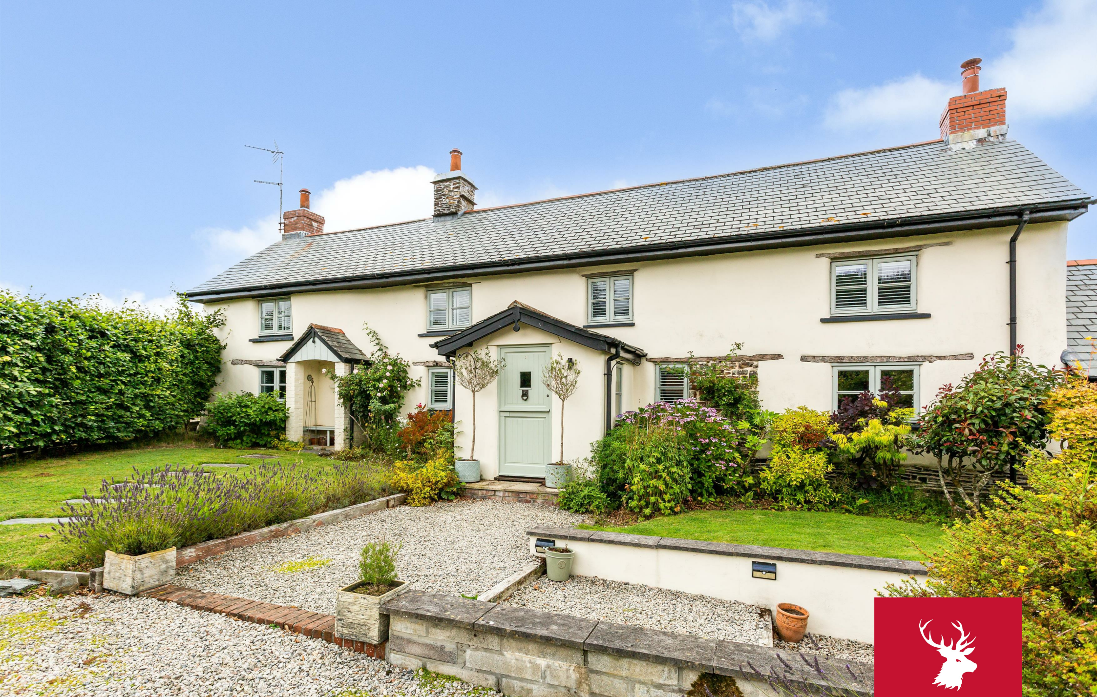
The Old Farmhouse