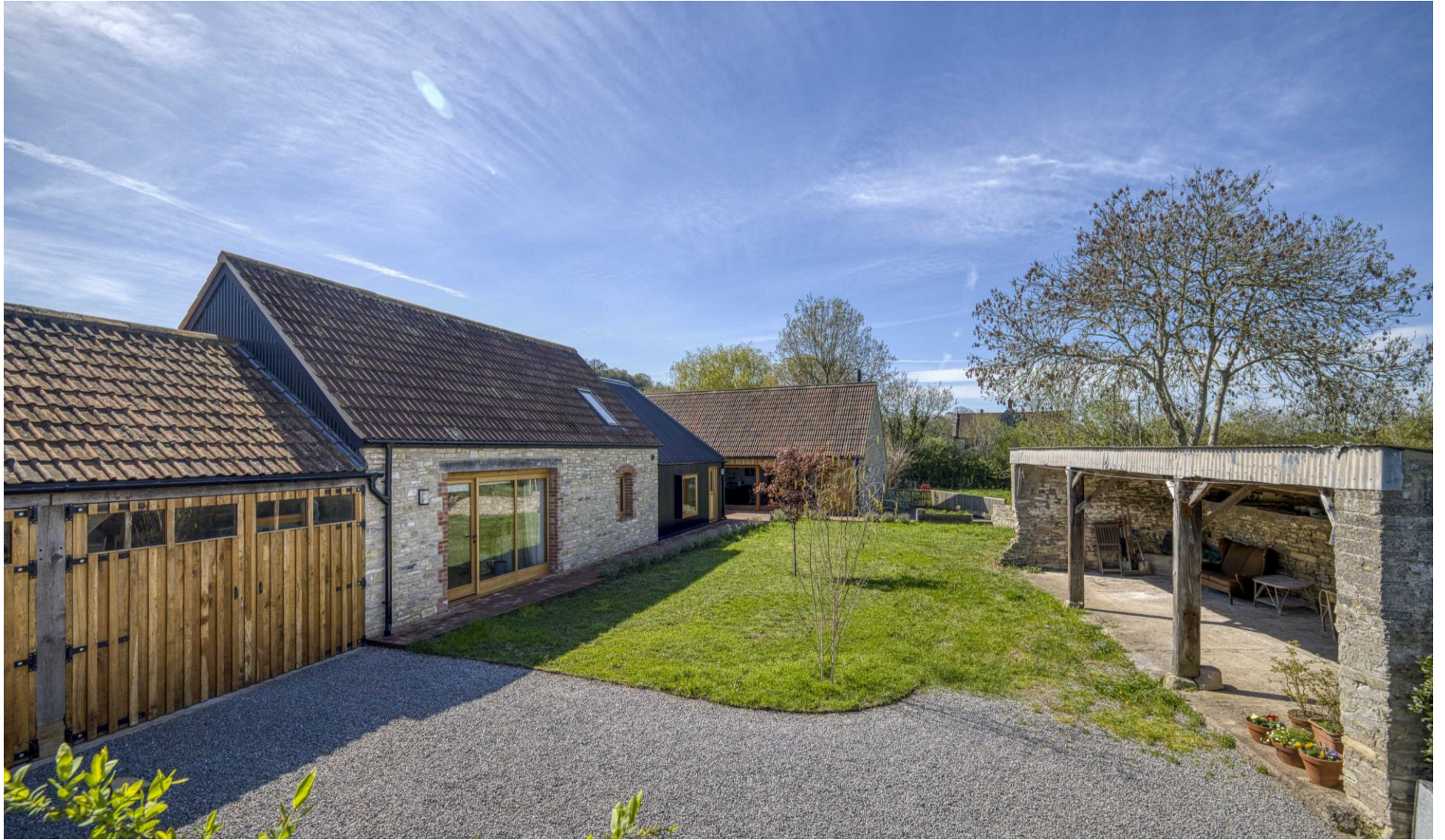
The Stables, Henton