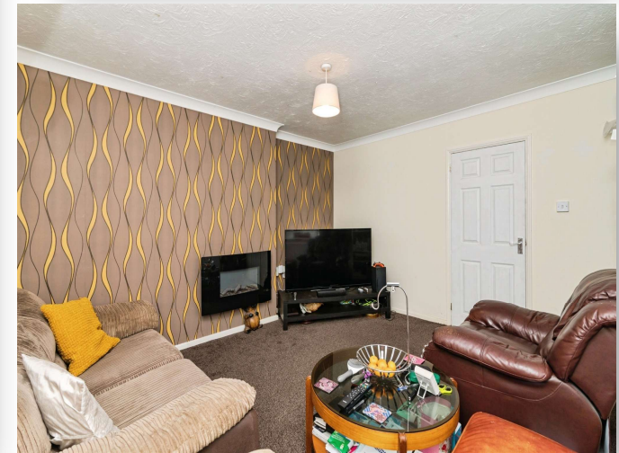
Summerfield Gardens, Lowestoft NR33 9BS