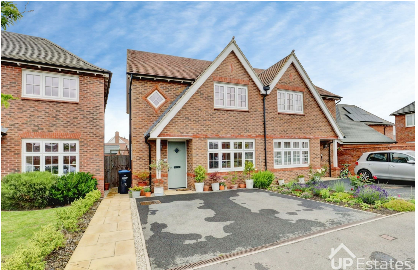
Birch Ground Close, Houlton, Rugby