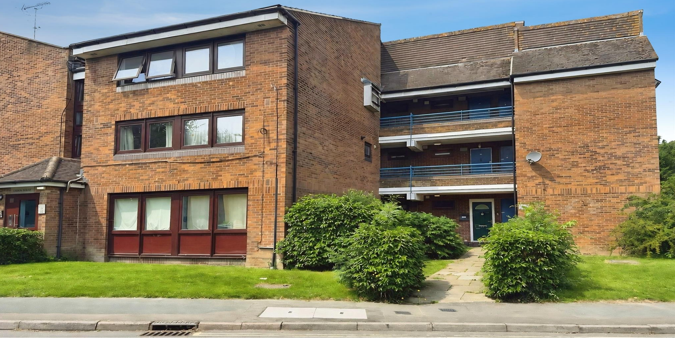
Lydon House Dobson Road, Crawley RH11 7UQ