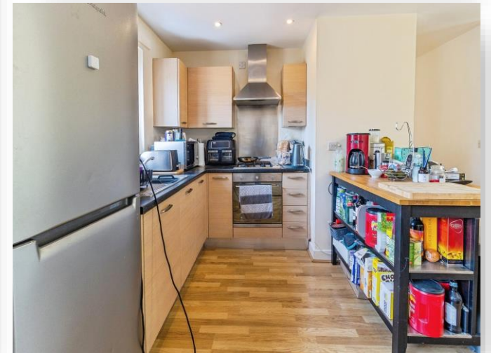
Hopcrofts Meadow, Redhouse Park, Milton Keynes, MK14 5BY