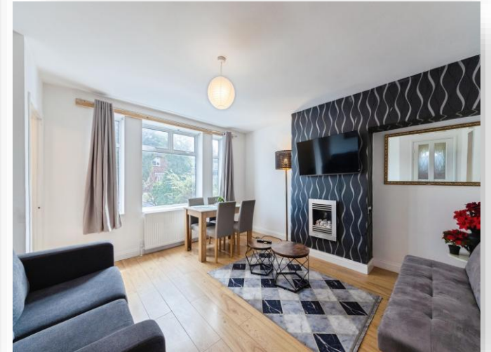
62 Mapleton Road, Birmingham B28 9RA