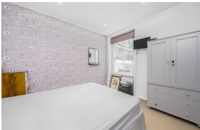
Dove Mews, SW5