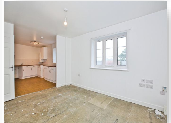
Raven Court, Houndstone, Yeovil, BA22 8GB