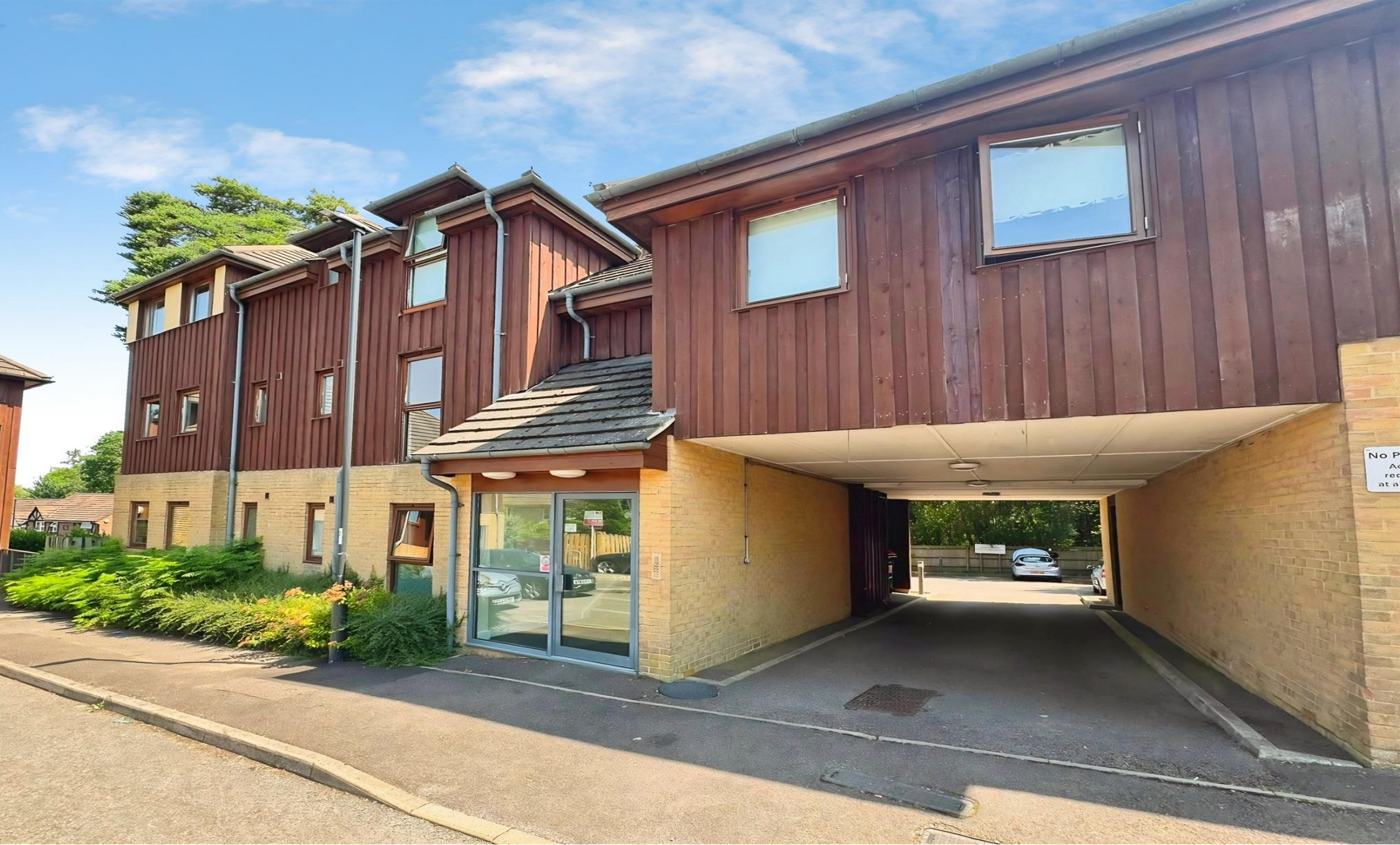
Oakwood Court, Crawley RH11 9TT