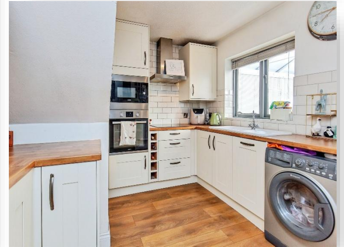
Manor Road, Stilton Peterborough PE7 3XA