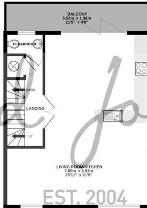
1ST FLOOR 51.5 sq.m. (554 sq.ft.) approx.