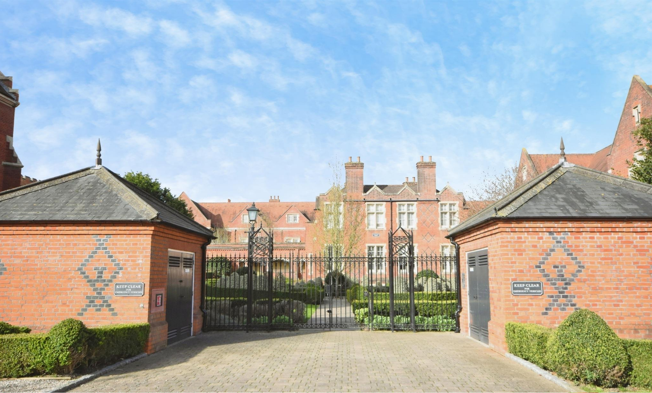
Kavanagh Court, The Galleries, Warley, Brentwood, CM14 5FF