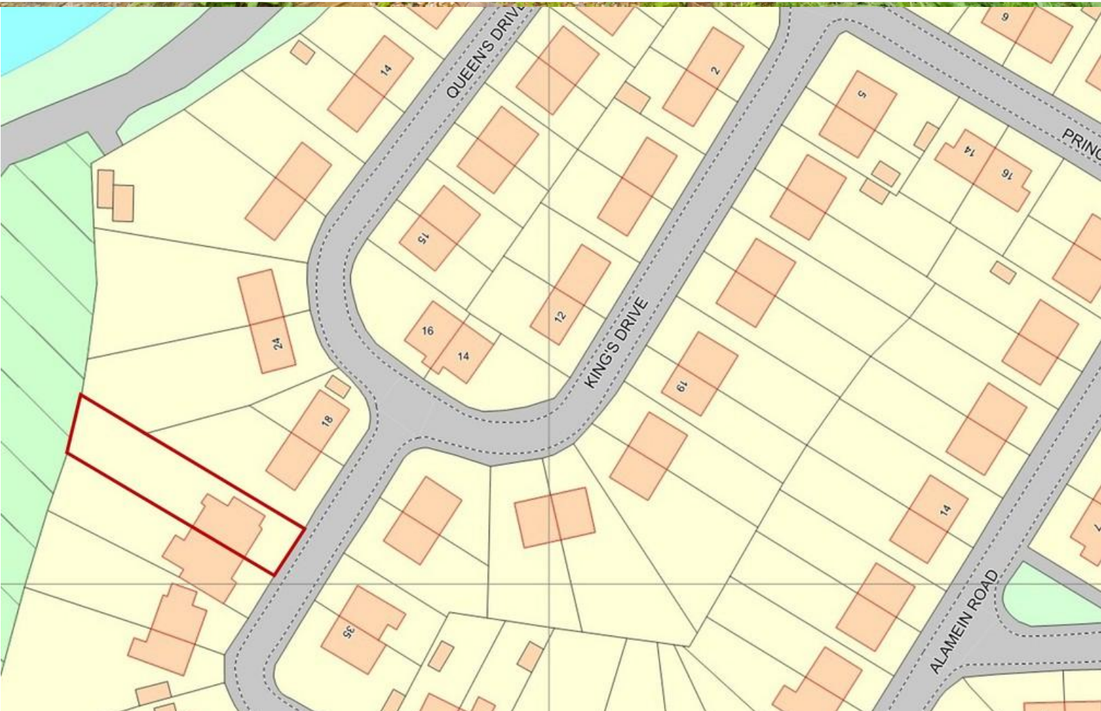
Ordnance Survey 00456532

Request a Viewing Online or Call 01524 737727