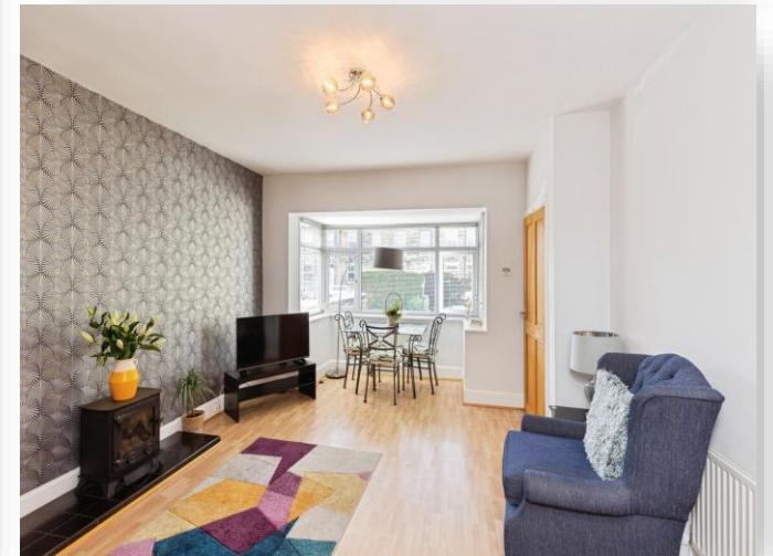
Eddison Street, Farsley Pudsey LS28 5BX