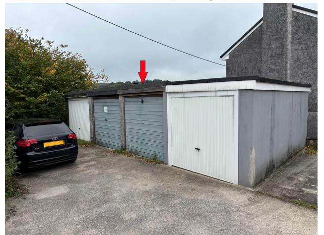
SINGLE GARAGE (EN-BLOC)