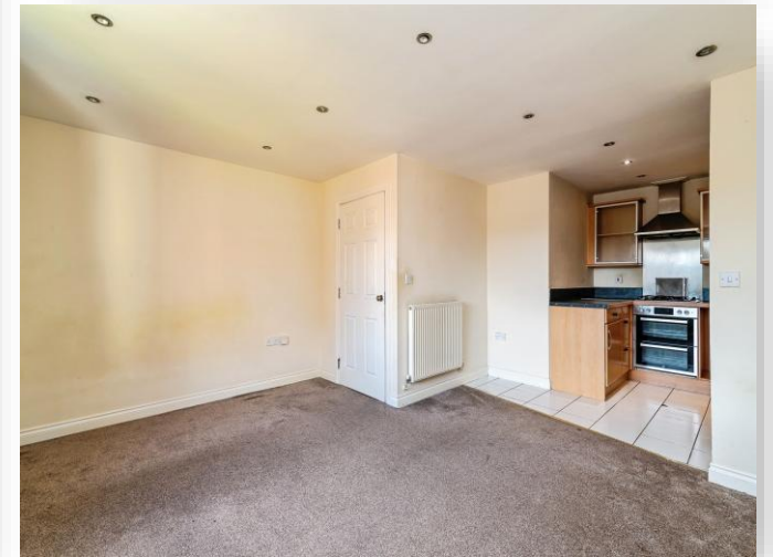
Eton Place Loughborough Road, West Bridgford Nottingham NG2 7EA