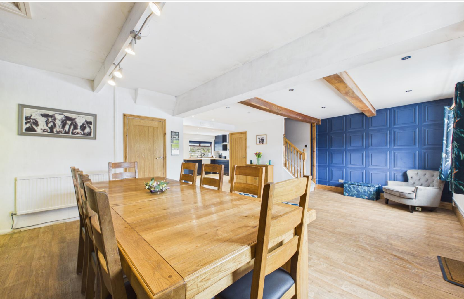
Kitchen/ dining room