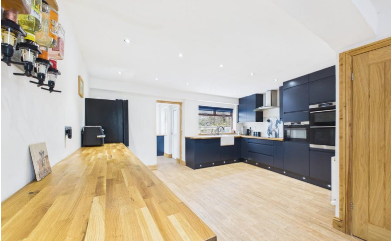
Kitchen/ dining room