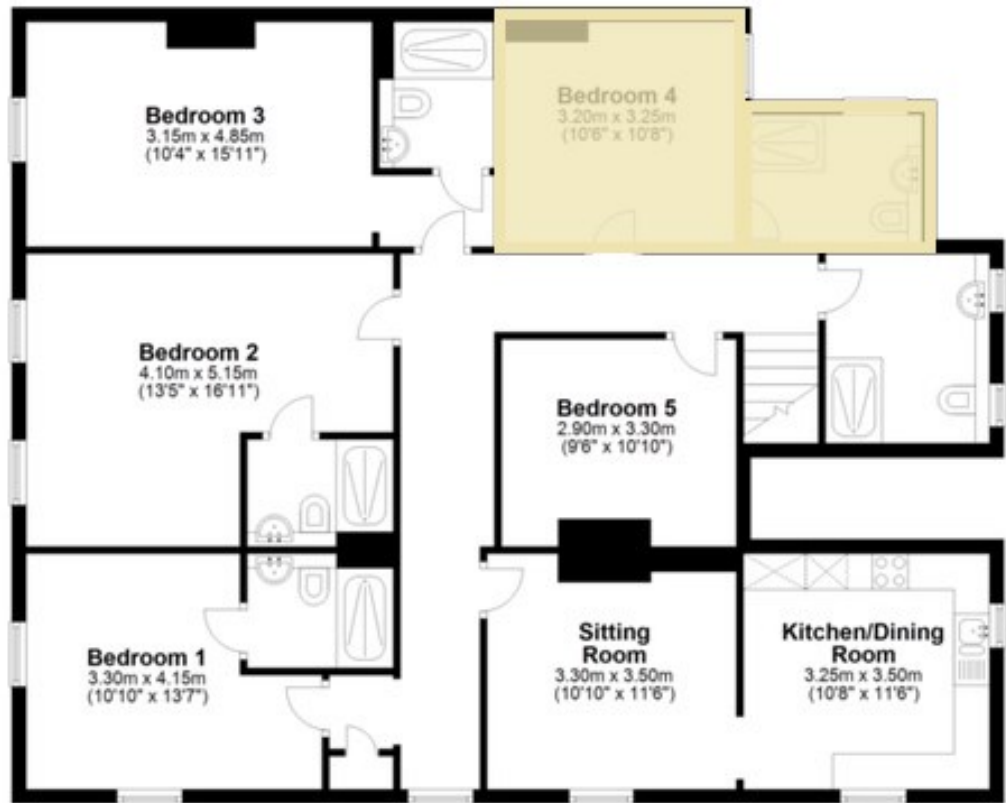
First Floor Approx. 133.3 sq. metres (1435.0 sq. feet)