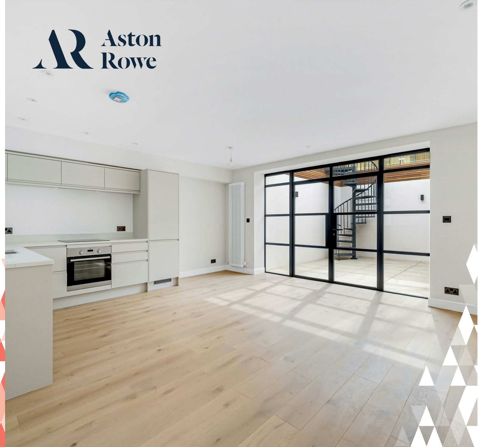
Mill Hill Road Approximate Gross Internal Area = 72.0 sq m / 775 sq ft