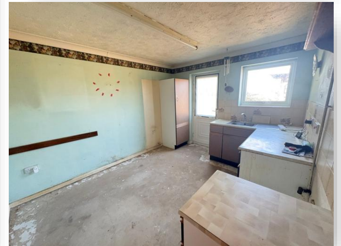
Winston Way, Farcet Peterborough PE7 3BU