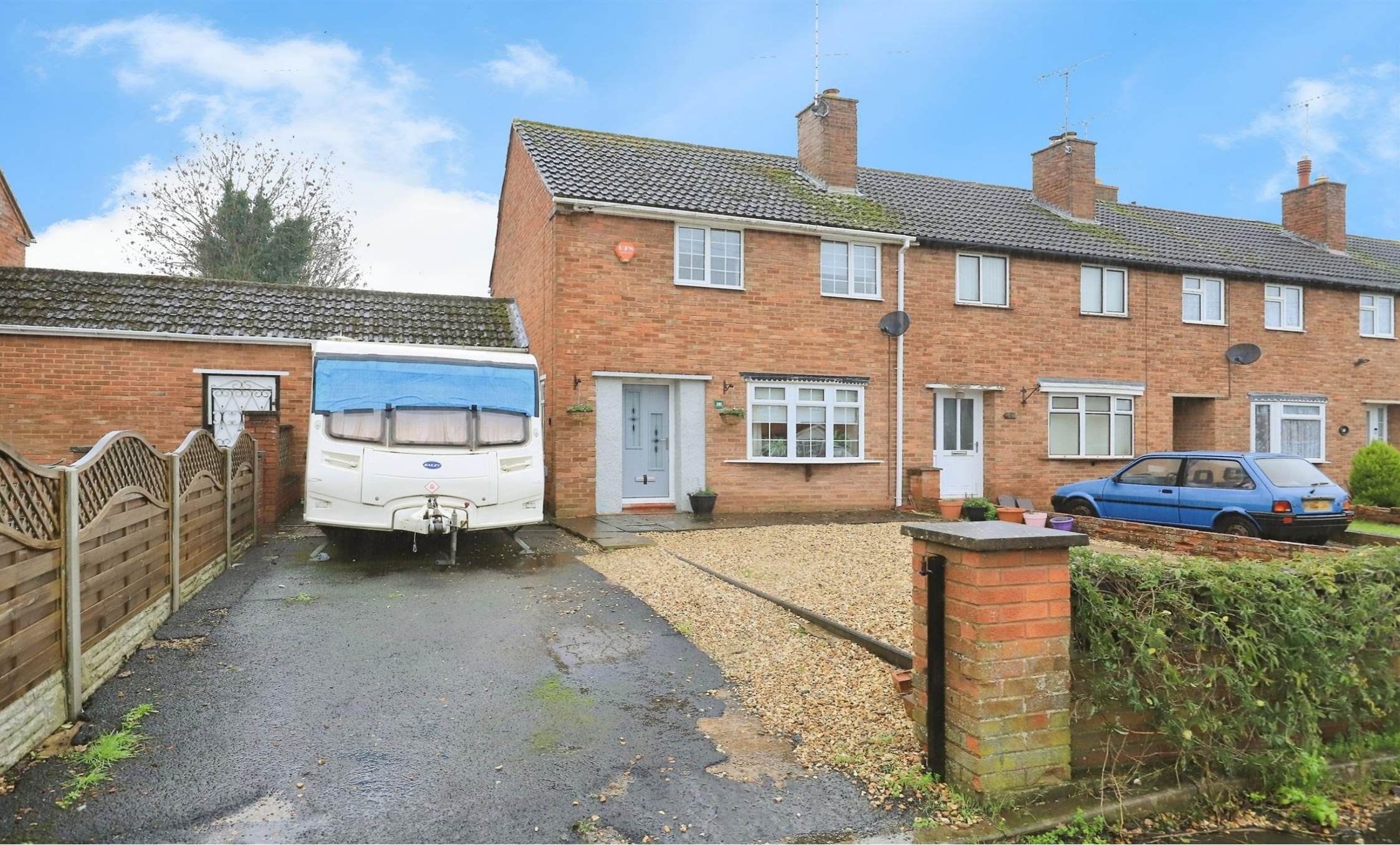
Hanstone Road, Stourport-On-Severn DY13 0HB