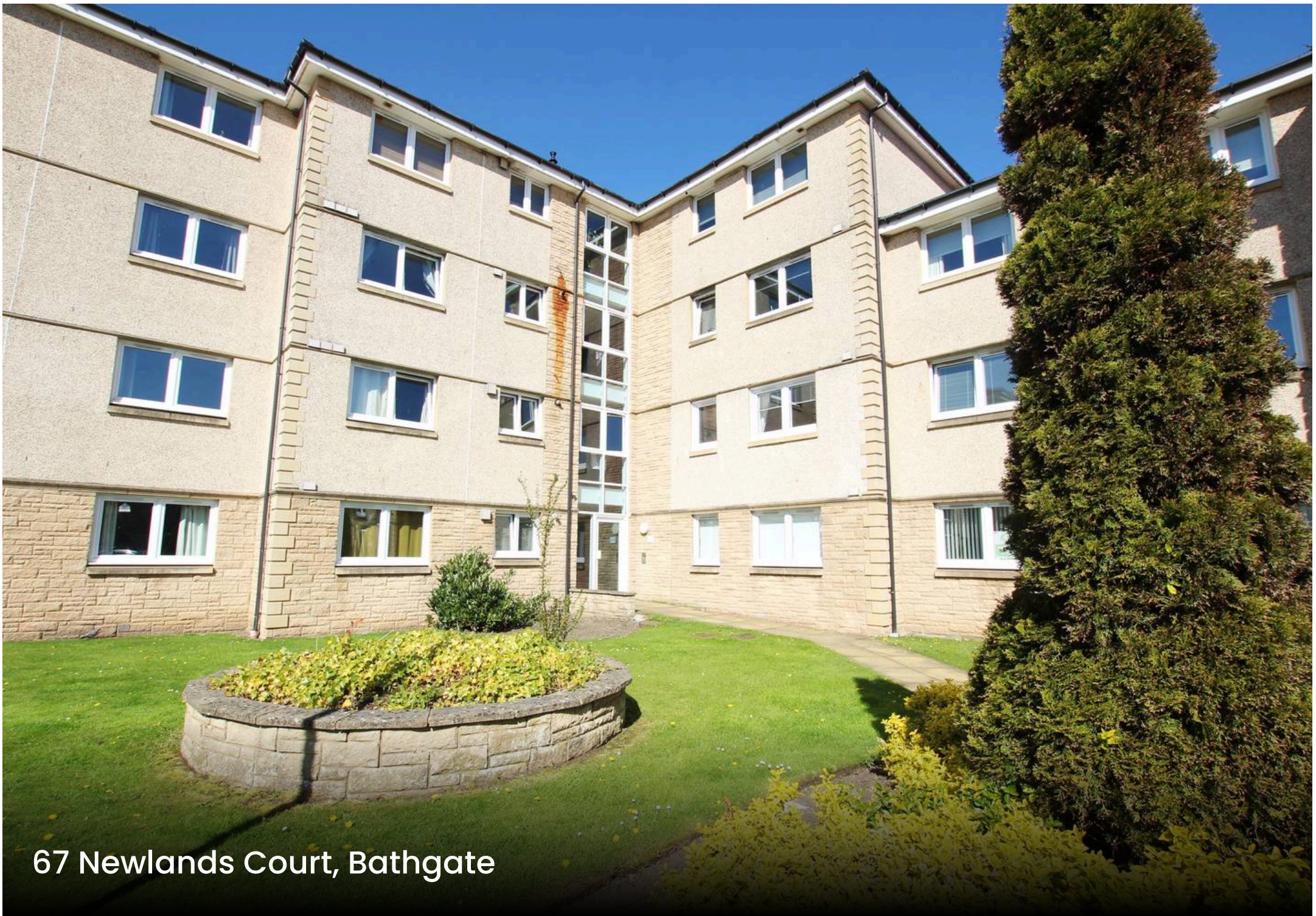
67 Newlands Court, Bathgate