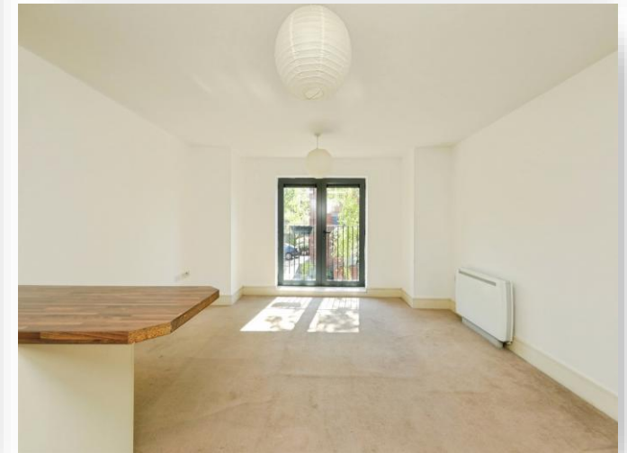
Kilner Court, Denaby Main Doncaster DN12 4DH