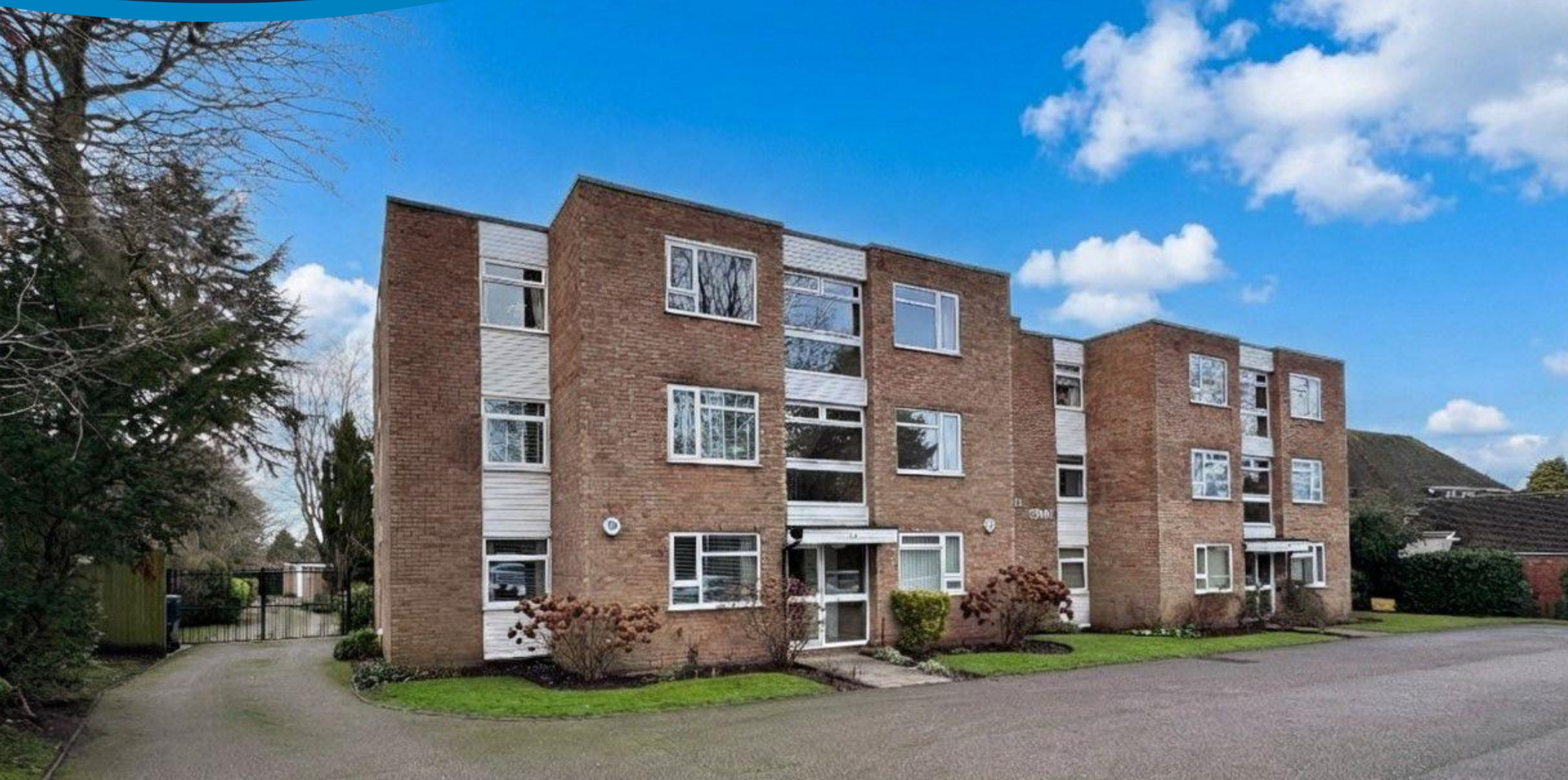
Russell Court, Walsall Road, Four Oaks, Sutton Coldfield, B74 4NS