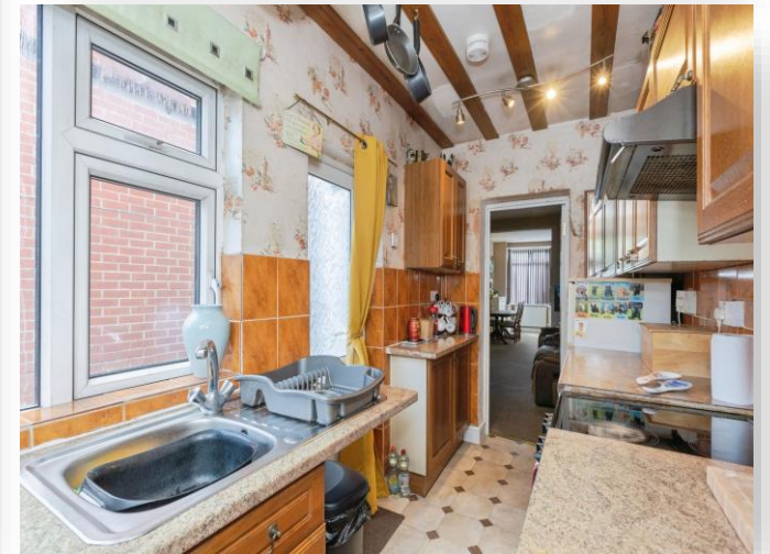
Oliver Road, Leicester LE4 7GQ