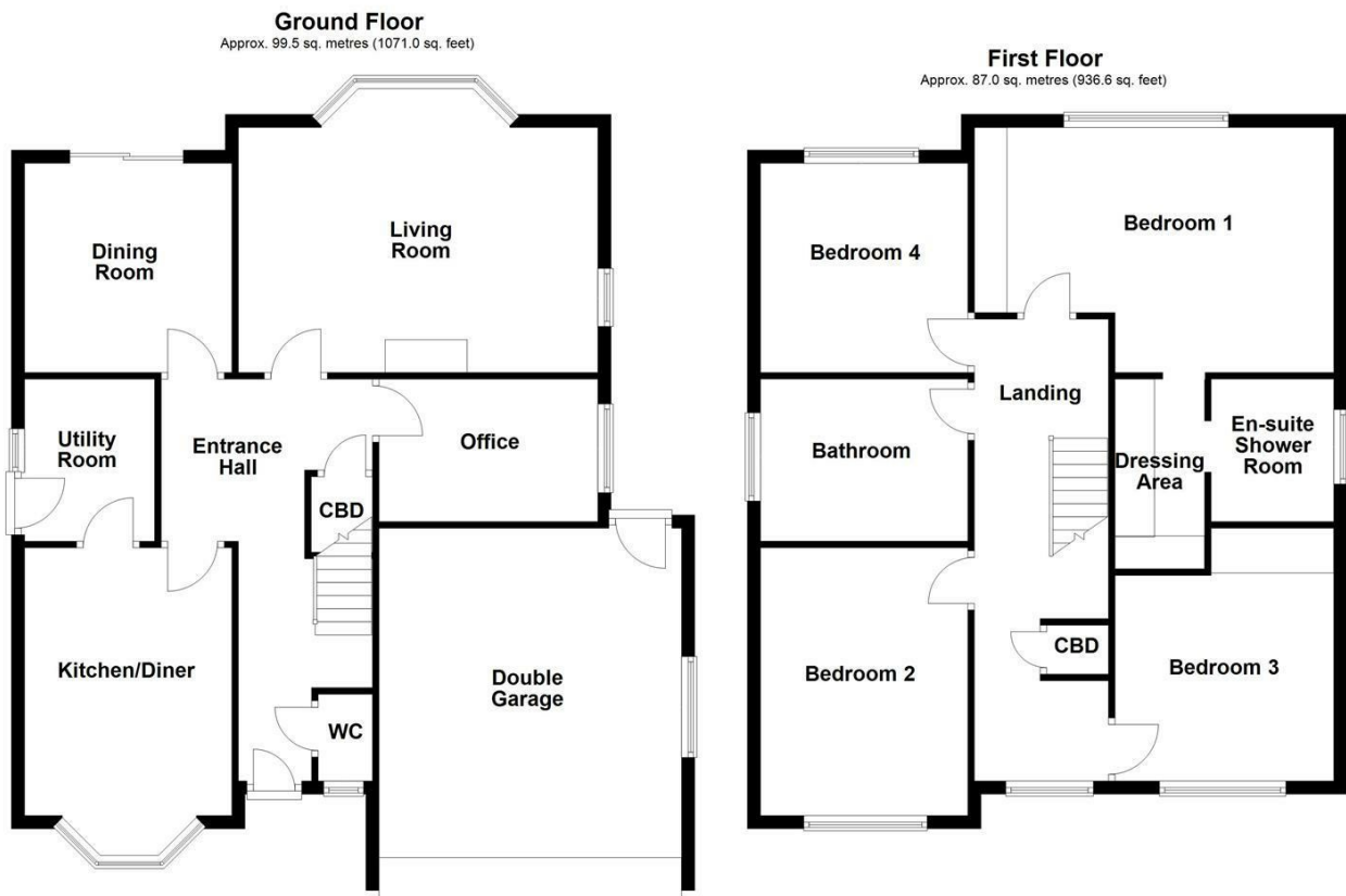
Total area: approx. 186.5 sq. metres (2007.6 sq. feet)