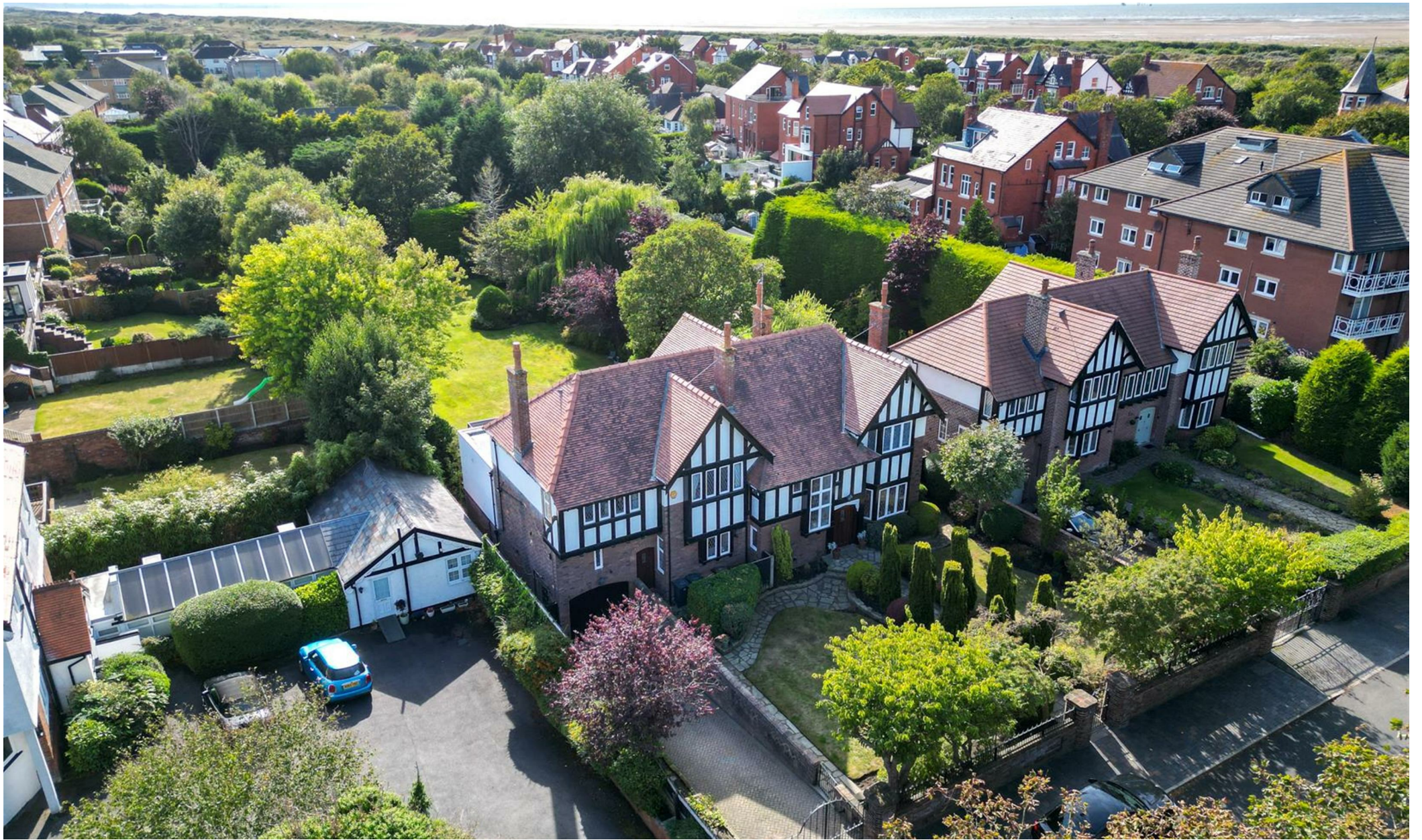
GOLF | CHARLOTTE HOUSE, GROUND FLOOR, 35-37 HOGHTON STREET, SOUTHPORT, MERSEYSIDE, PR9 0NS