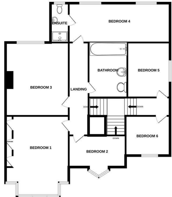
1ST FLOOR 1352 sq.ft. (125.6 sq.m.) approx.