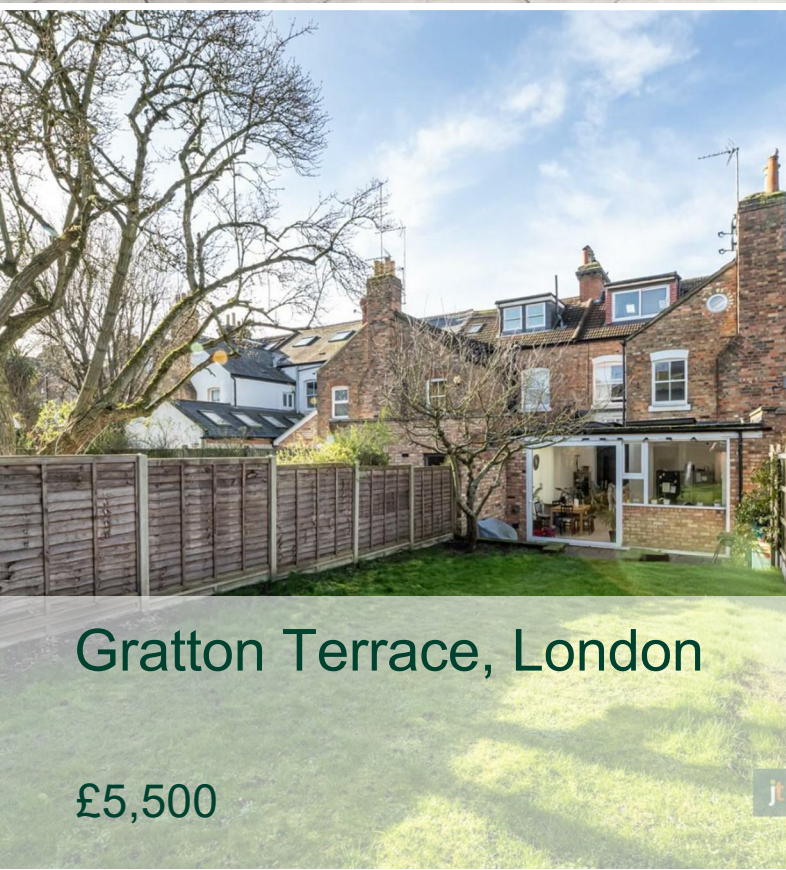
Gratton Terrace, London