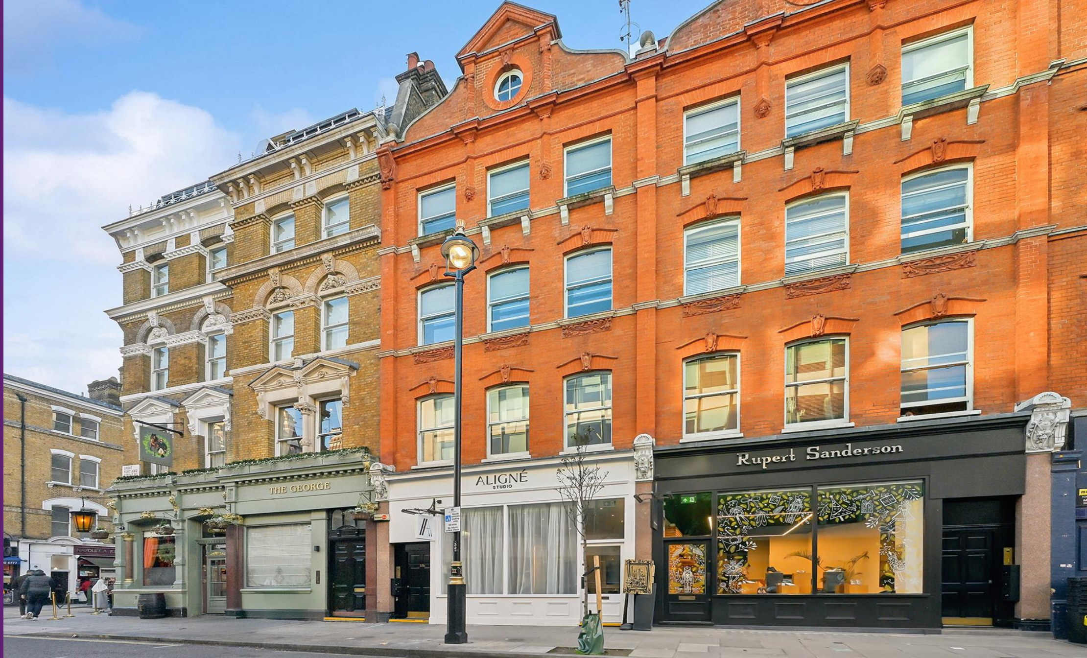
Great Portland Street Marylebone, W1W