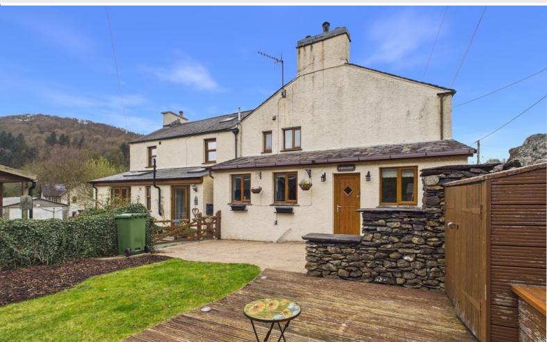
Outside at 2 Bens Row

Oozing with curb appeal and original features the cottage welcomes you in.