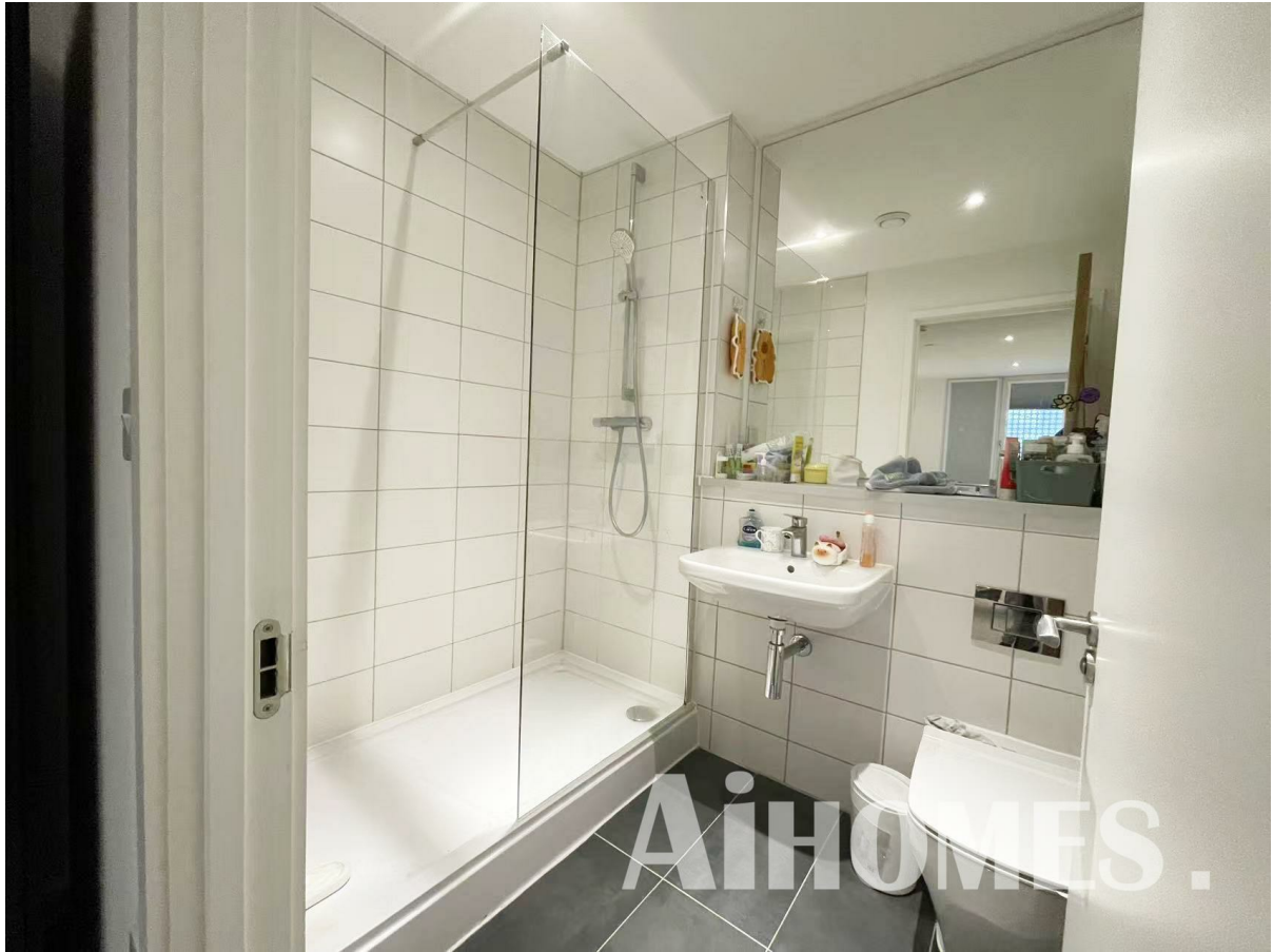
Modern 2B2B Apartment | Burlington Square | Manchester M15174095RS