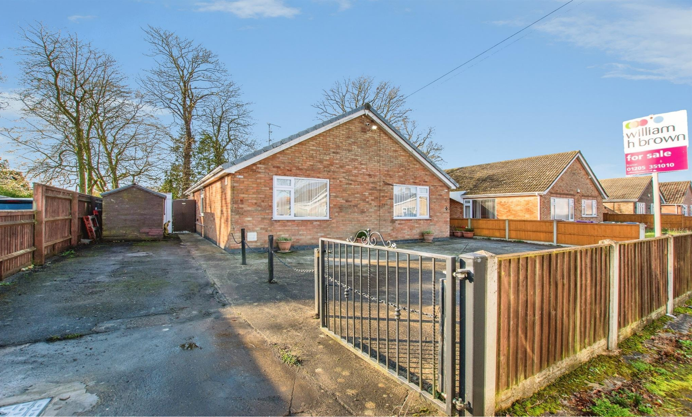
Coningsby Close, BOSTON PE21 8HP