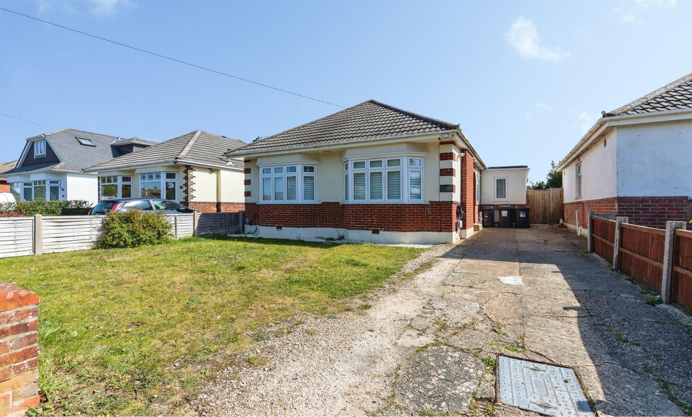
Hill View Road, Bournemouth BH10 5BJ