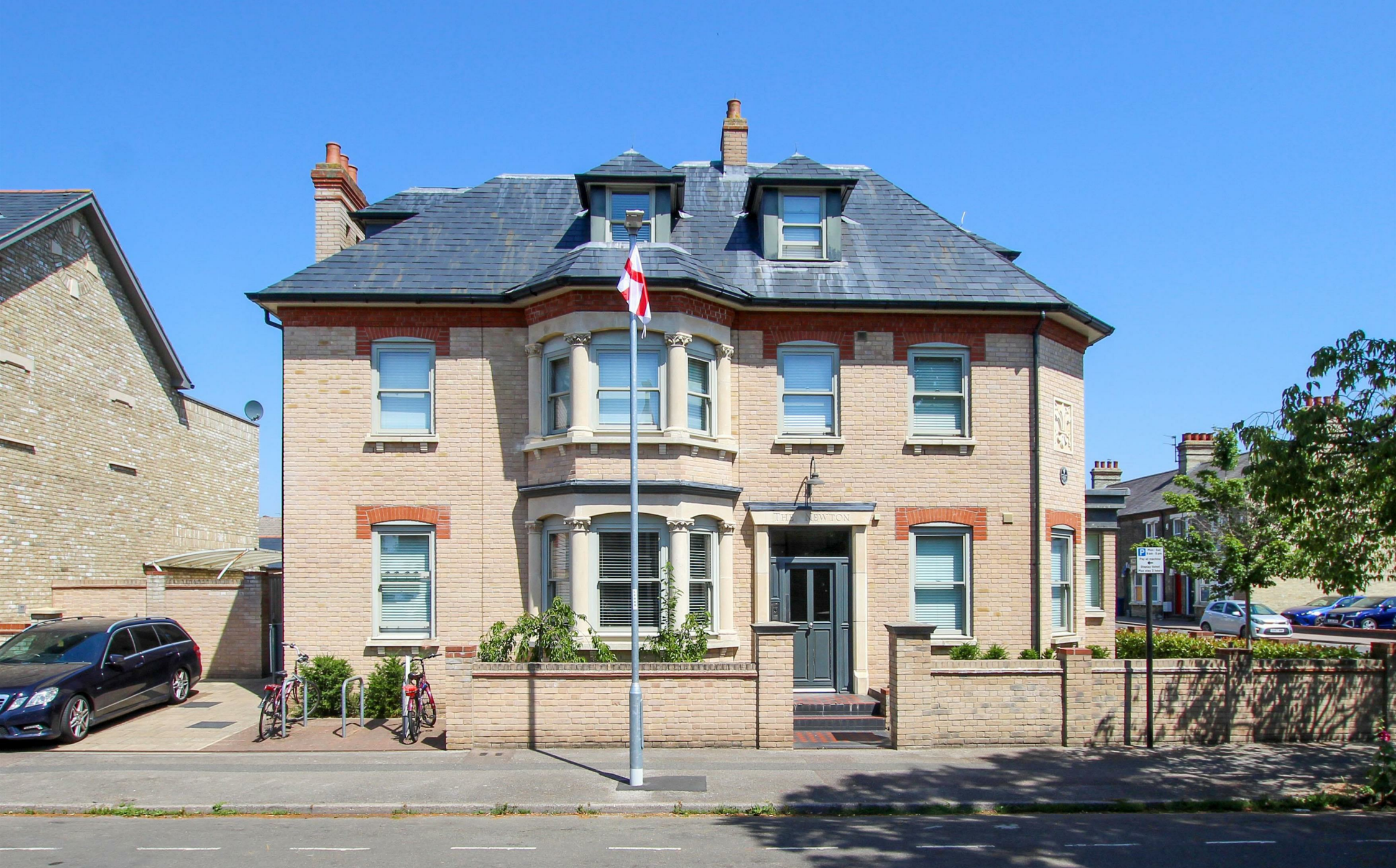
The Newton, Humberstone Road, Cambridge, CB4 1EZ